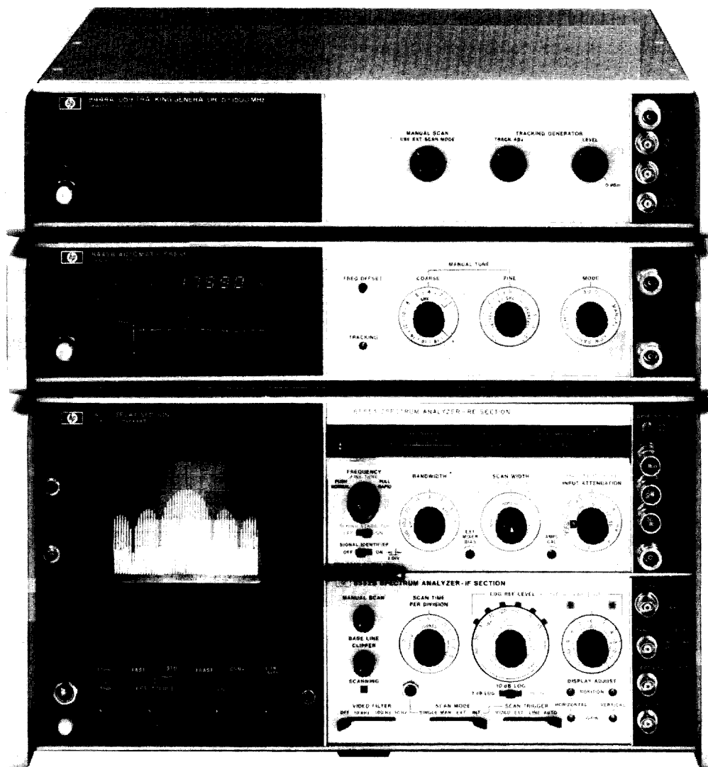
HP 8555A (141T, 8552B) 8444A Opt 059, 8445B

The HP 8555A Tuning Section offers multiband coverage from 10 MHz to 18 GHz. The range can be extended to 40 GHz with the HP 11517A external waveguide mixer (see page 697). The HP 8555A provides high sensitivity ( -125 dBm), high resolution (100 Hz) and frequency scans as wide as 8 GHz. The HP 8555A is well suited for measurements necessary during both the design and production phases of microwave devices and systems.