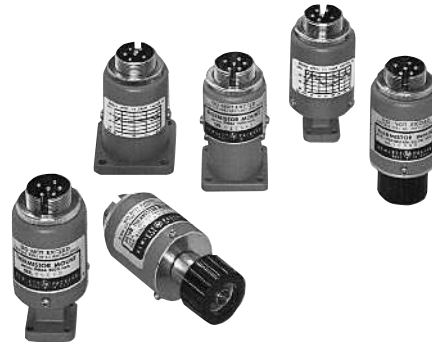
HP Thermistor Mounts