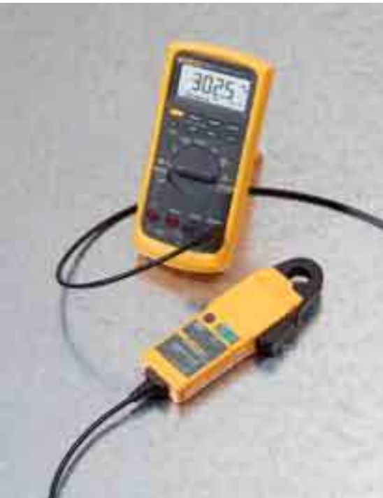
i30 connected to a Fluke 87V Digital Multimeter.

Fluke. Keeping your world up and running.