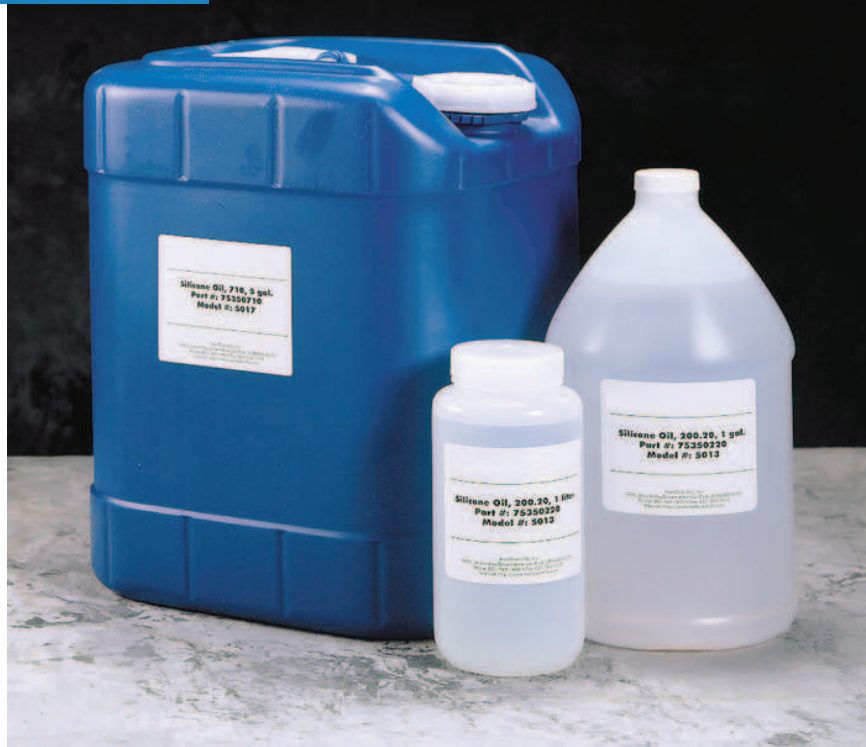
Fluke Calibration offers a wide variety of bath fluids in different container sizes.

Viscosity is a measure of a fluid's resistance to flow—we often think of it simply as "thickness." Kinematic viscosity is the ratio of absolute viscosity to density and is measured in "stokes" (at a specific temperature), which are commonly divided by 100 to give us more helpful "centistokes." The higher the number of centistokes, the more viscous (or thick) a fluid is. Viscosity is always stated at a specific temperature (often at 25 °C) and increases as the fluid's temperature decreases (and vice versa).