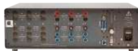
Fluke Norma 5000 (rear panel)