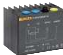
32 A Planar Shunt