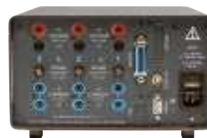
Fluke Norma 4000 (rear panel)

Each modular plug-in power phase consists of a voltage and a current measurement channel. Each measuring channel is available for each basic unit. However, only one kind of channel can be used per unit (see standard configurations).