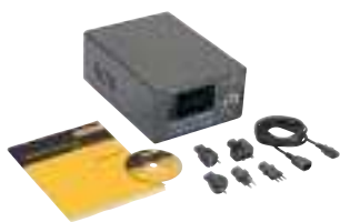
Fluke Norma 4000 Basic Configuration