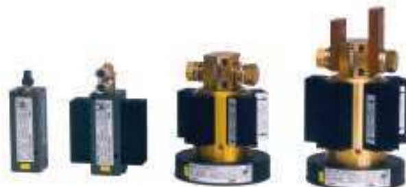
Optional shunts for Fluke Norma Series power analyzers