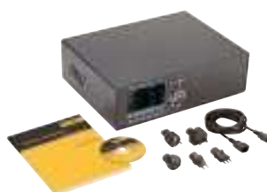
Fluke Norma 5000 Basic Configuration