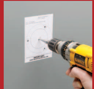
Position with template