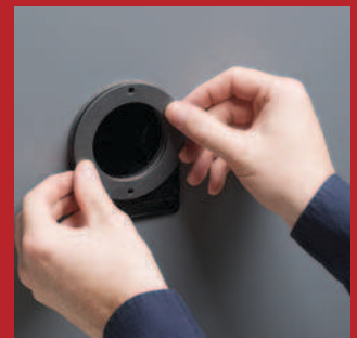
Affix the window

For detailed installation see the UL validated installation instructions supplied