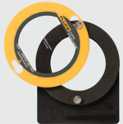
Fluke CLKTO IR Window for indoor medium voltage applications up to 38 kV