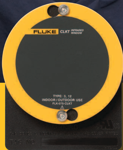
Outdoor/indoor any voltage, arc-tested