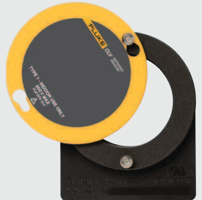
Fluke CLV IR Window for indoor low voltage applications up to 600 V