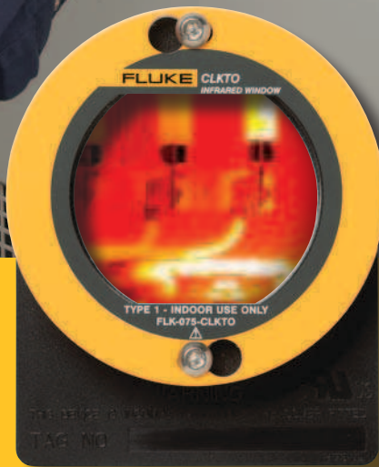
Indoor medium voltage