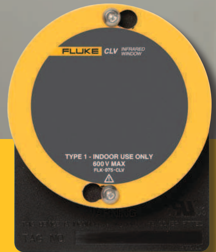
Indoor low voltage

info@Fluke-Direct.com www.valuetronics.com