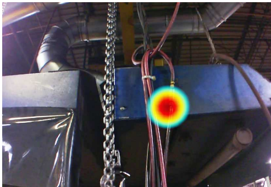
Images taken with the ii900 Sonic Industrial Imager in an industrial environment.

Fluke. Keeping your world up and running.®