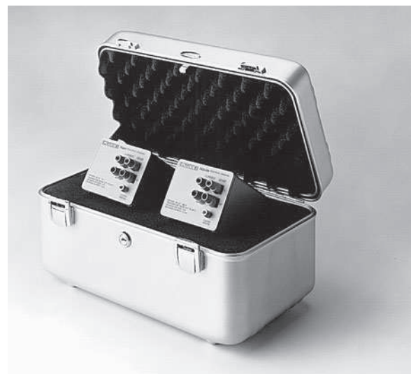
Optional 742A-7002 transit case

Fluke. Keeping your world up and running.