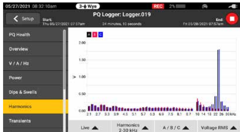
A full range of harmonics are available from the first 50 integer harmonics and from 2 kHz to 30 kHz

The Fluke 1770 Series was designed to be safe and easy to use in any measurement environment. The 1770 Series allows you to capture a full range of power quality variables as well as high-speed waveforms, high-speed transients, and higher frequency harmonics, all of which are instantly viewable on the large, high-resolution screen. With a best-in-class CAT IV 600 V / CAT III 1000 V overvoltage rating, these analyzers can be used at the service entrance or downstream, measuring AC and DC inputs, and harmonics measuring up to 30 kHz. With the 1770 Series you can be confident that you'll capture the data you need to make better maintenance decisions no matter the task.