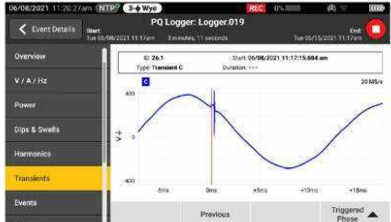
View real-time voltage transitory events while logging for faster troubleshooting

Transients negatively impact otherwise healthy systems every day and their potential to damage your equipment can't be underestimated. Whether your system is experiencing impulsive or oscillatory transients, the results can be devastating and cause problems ranging from insulation failures to total equipment failures. The Fluke 1775 and Fluke 1777 incorporate advanced transient capture technology to help you clearly identify high-speed voltage transients, so you have the data you need to stop them in their tracks. The Fluke 1775 Power Quality Analyzer has 1MHz sampling capability to capture fast transients, while the Fluke 1777 Power Quality Analyzer has 20MHz sampling capability to capture the fastest transients in high detail.