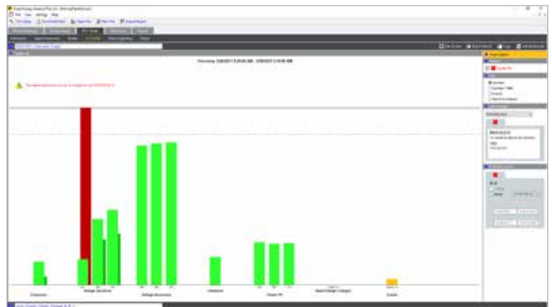
Fluke Energy Analyze Plus: Power quality health summary