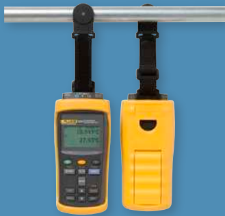
TPAK Magnetic Hanger