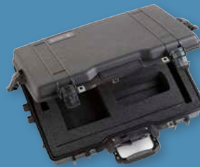
Probe and Readout Case