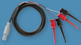
Universal RTD Adapter