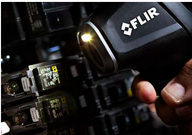
TG54 and TG56 feature powerful LED worklights