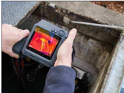
Up to 161,472 pixel resolution for accurate readings on distant targets