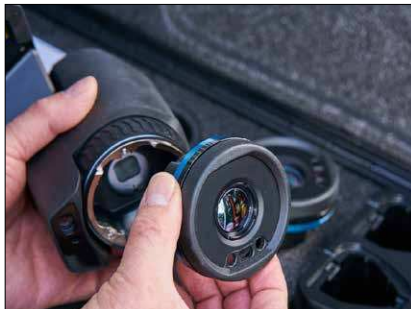
Share lenses (wide angle to telephoto) across your fleet of cameras thanks to AutoCal™ optics