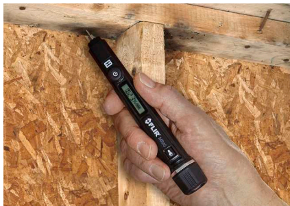
Rugged, compact design for measurements in tight spaces