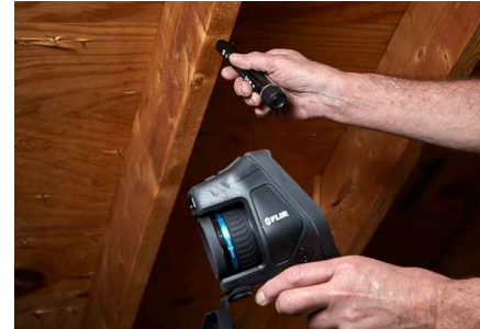
Use MR40 to confirm whether the cold spot found in a thermal image is moisture