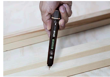
Quick and easy to use; reliable and accurate results

Specifications are subject to change without notice. For the most up-to-date specifications, go to www.flir.com