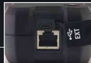
Charging and accessory ports