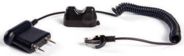
MR02 Pin Probe included

PORTLAND Corporate Headquarters FLIR Systems, Inc. 27700 SW Parkway Ave. Wilsonville, OR 97070 USA PH: +1 503.498.3547