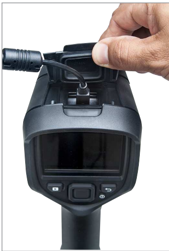
Download images fast via USB.

Specifications are subject to change without notice. For the most up-to-date specifications, go to www.flir.com