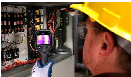
Variable emissivity and reflected temperature parameters give you reliable results fast