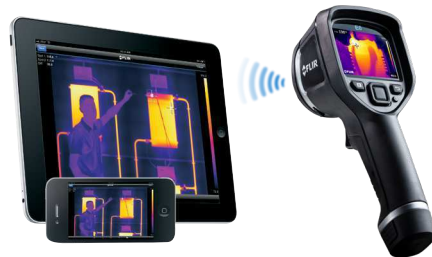
Wireless connectivity to smartphones, tablets and more.

*After product registration on www.flir.com