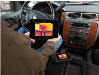
Upload images to FLIR Tools over Wi-Fi