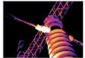
Multiple FLIR A320s can be networked through their 100baseT Ethernet connections, ideal for Power Utility Asset Management.