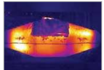
Many fluid vessels, such as chemical reactors, storage tanks and piping systems, need to be monitored to spot abnormal temperatures and trends that warn of product loss or unsafe conditions.