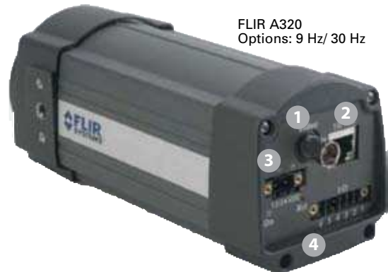
FLIR A320 Options: 9 Hz/ 30 Hz