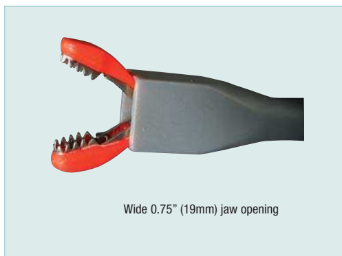
Wide 0.75" (19mm) jaw opening