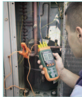
Simultaneously measures 4 temperature inputs for multiple source monitoring