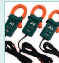
Model PQ34-12 1200A Current Clamp Probes with 2" (50mm) jaw opening