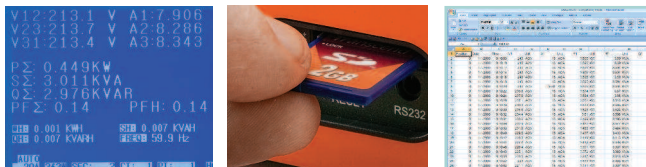
Backlit LCD displays numerical values. The data can be stored in SD memory card (included) and then transferred from meter to PC using Excel ® software and datalogged readings.