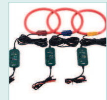
Model PQ34-30 3000A (24"/600mm) Flexible Current Clamp Probes for wrapping around busbars