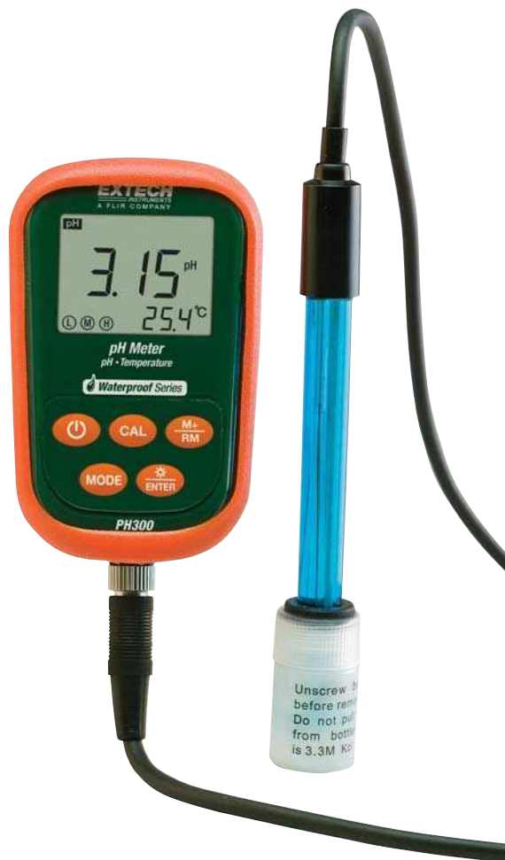
Large blue backlit dual LCD display with calibration and memory indicators