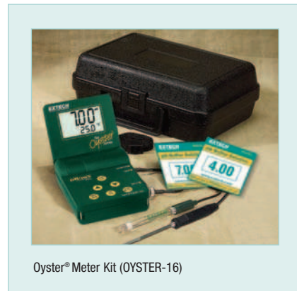
Oyster® Meter Kit (OYSTER-16)