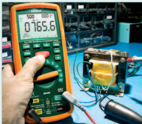
Measure the insulation resistance of transformer windings