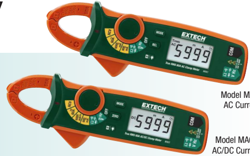
Model MA61 AC Current