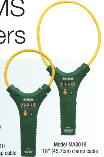
Model MA3018 18" (45.7cm) clamp cable