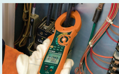
2.0" (52mm) jaw size for conductors up to 500MCM