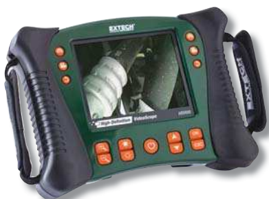
HDV600 Display Unit

You may also configure customized solutions by starting with an HDV600 display unit (no probe included) and selecting optional probes and/or handsets listed above.