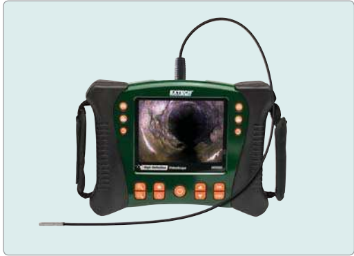
HDV610 VideoScope with 5.5mm diameter flexible probe (1m length)