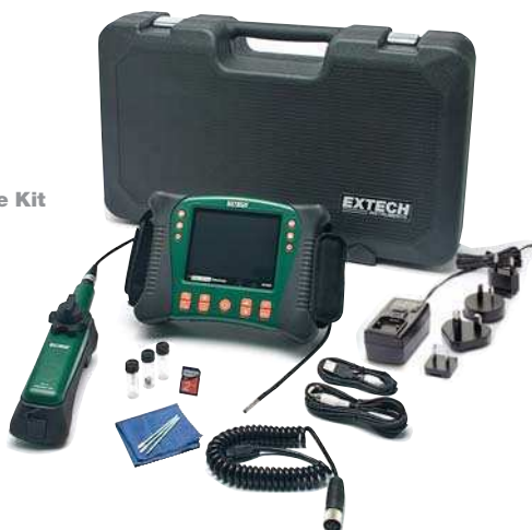
HDV640 Complete Kit

The HDV600 series is designed with capabilities and accessories to give you a rolling start while still permitting you to expand functionality as your needs change.