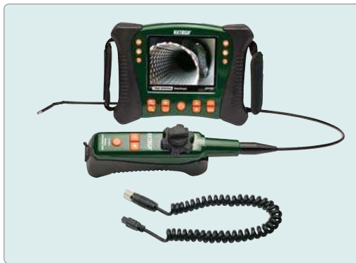
HDV640W VideoScope, wireless handset & 6mm diameter semi-rigid articulated (240°) probe