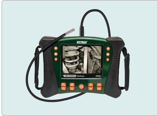
HDV620 VideoScope with 5.8mm diameter semi-rigid probe (1m length)