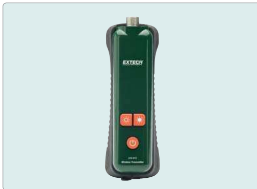
HDV-WTX Universal wireless handset, accepts several scopes of varying diameters, lengths, and flexibility