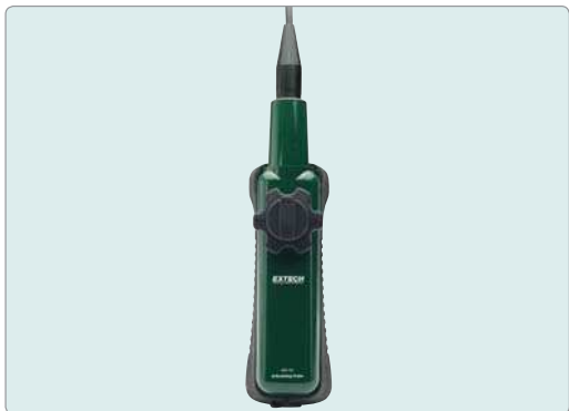
HDV-TX1, HDV-TX2 Wired handset with 6mm diameter semi-rigid articulated (240°) probe (1m, 2m versions)