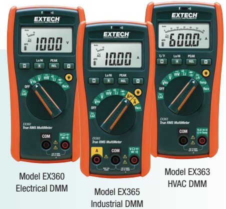
Model EX360 Electrical DMM

True RMS provides accurate readings when measuring distorted or noisy waveforms. Choose a model designed for Electrical, HVAC, or Industrial Applications. Advanced LoZ feature eliminates false readings caused by ghost voltages. CAT IV safety rating ensures the highest level of protection.