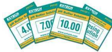
PH103 includes 6 pouches each of pH 4, pH 7, and pH 10 Buffers plus 2 Rinse solutions