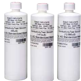
EC-84-P, EC-1413-P, and EC-12880-P pint size conductivity standards