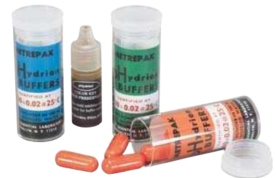
650470 pH 4, 7, and 10 buffer capsules with color key preservative