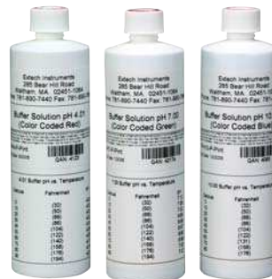
Pint size pH buffers for pH 4, 7, and 10 available (PH4-P, PH7-P, PH10-P)