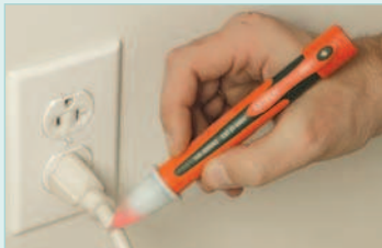
Quickly check for the presence of live wires before testing