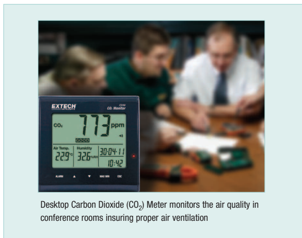
Desktop Carbon Dioxide (CO 2 ) Meter monitors the air quality in conference rooms insuring proper air ventilation