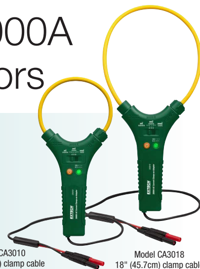
Model CA3010 10" (25.4cm) clamp cable

Expand your meter's capabilities to measure AC Current up to 3000A. Fit most MultiMeters or Clamp Meters with standard shrouded banana plug sockets. Flexible clamp jaw easily wraps around bus bars and cable bundles where standard clamp adaptors and meters can't. The thin 7.5mm cable diameter easily fits into tight spaces. Choose between a 10" (25.4cm) or 18" (45.7cm) clamp cable length.