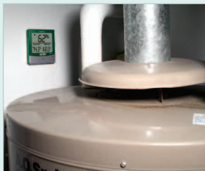
Monitoring Dew Point levels in a Basement for potential mold growth.