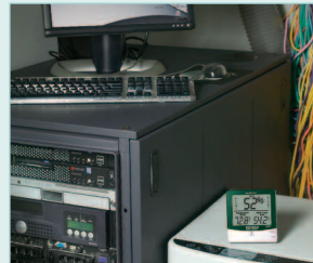
Alerts low Humidity levels in Computer rooms to help prevent electrostatic conditions.