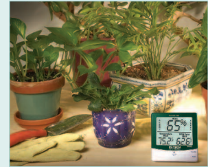
Checks the Humidity and Temperature levels for optimal plant growth in greenhouses.