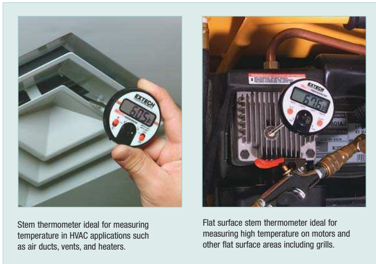
Stem thermometer ideal for measuring temperature in HVAC applications such as air ducts, vents, and heaters.