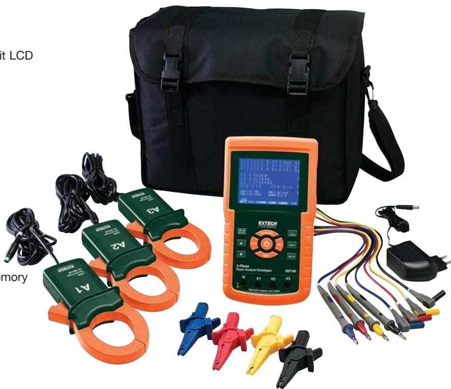
Complete with 3 current clamps, 4 voltage leads with alligator clips, 8 AA batteries, SD memory card, Universal AC adaptor (100 to 240V), and case