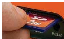
SD memory card included