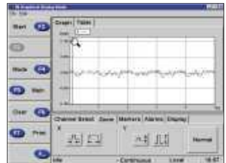
Comparison of power measured with a standard power meter (blue trace) and EXFO's new low-PDR detector (red trace)

A new detector option, specified for very low polarization-dependent response (IQ-1600-PL, with a PDR of 0.010 dBpp), provides improved relative uncertainty. Even with highly polarized sources such as DFB or tunable lasers, minor variations in the test setup (patchcord movement or pinching) don't affect readings beyond specified values. For IL or very low PDL component measurements, this detector provides optimal accuracy.