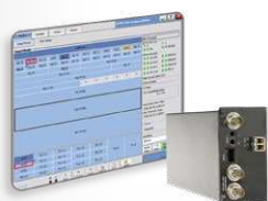
SONET/SDH test modules FTB-8115 – FTB-8120 FTB-8130 – FTB-8140