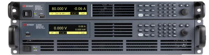
EL4900 DC Regenerative Electronic Load