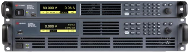
RP5900 DC Regenerative Power Supply