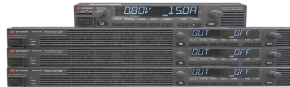
DP5700 DC Power Supply