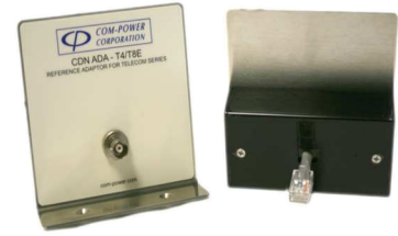
Shorting Adapter Set ADA-T4/T8