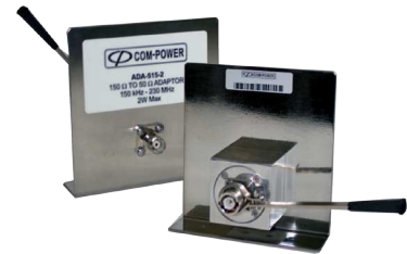
ADA-515-2 Adapter Set