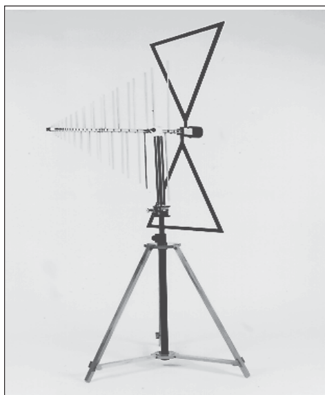
Figure 1-1. Combilog mounted on AT-100 tripod.