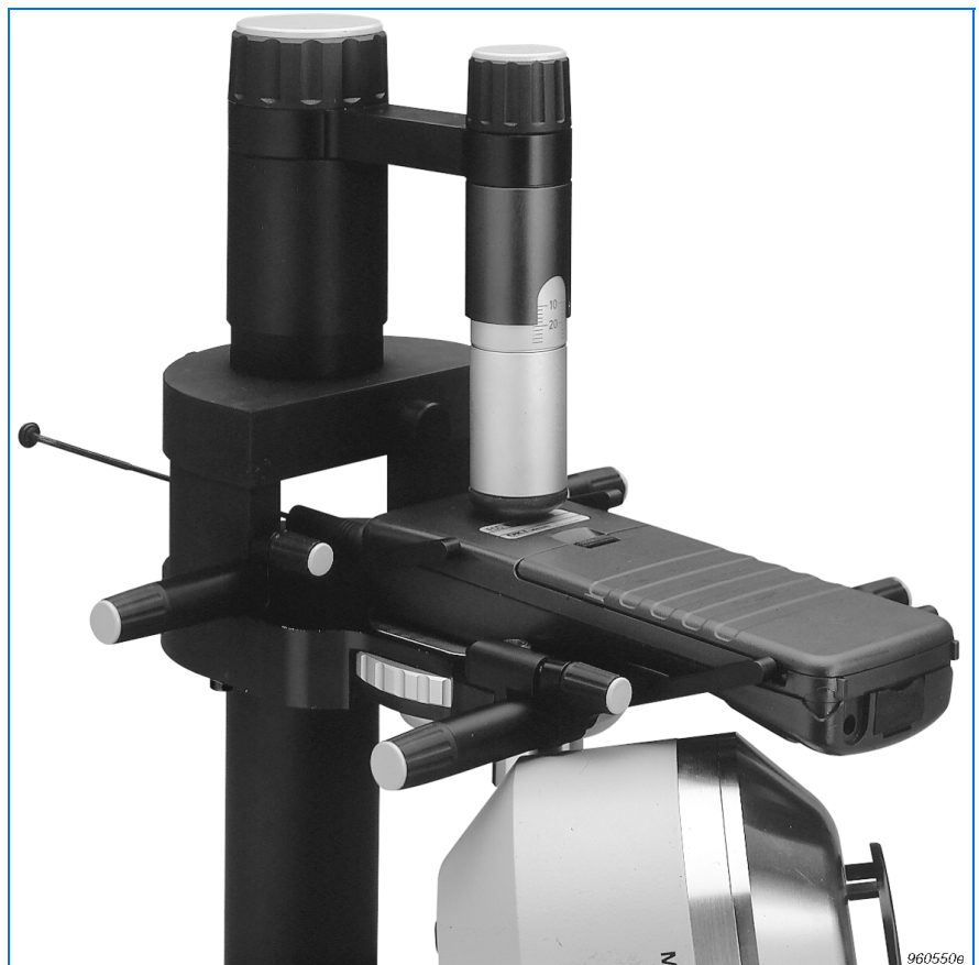
Fig.2 Telephone Test Head Type 4602B allows positioning of almost all telephones. The redesigned structure has room for mobile telephone antennas and batteries. The Test Head is supplied with extra alignment rods that allow non-symmetrical handsets to be positioned accurately and reliable

The new Type 4602B test head provides more space and adjustment range to allow for the new generation of slim handsets as well as the thick