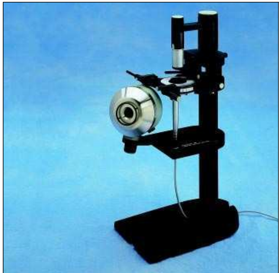
Fig.1 Telephone Test Head Type 4602B shown with Mouth Simulator Type 4227, in LRGP modal position, and Ear Simulator for Telephonometry Type 4195 (both must be ordered separately)