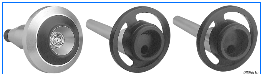
Fig.4 A number of ear simulators are available from Brüel & Kjær to accommodate all relevant telephone standards and recommendations