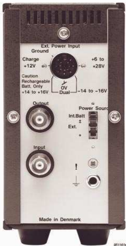
Fig. 2 Rear panel of Type 2635

Overload is indicated by an LED on the front panel. The overload detector monitors an overload condition at the input amplifier, low-pass filter, and at