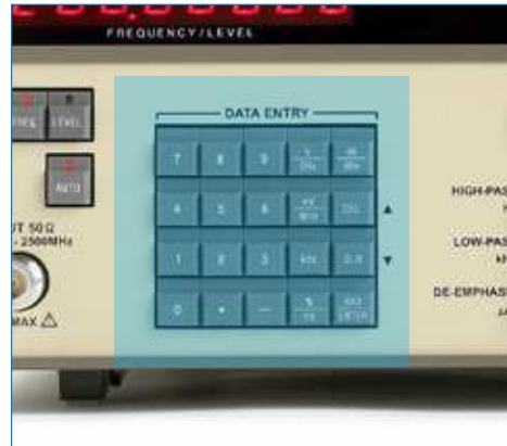
Figure-5: Data Keypad of 8201 Modulation Analyzer

Operation of the data keypad is conventional. The data keypads of the 8201 Modulation Analyzer are described as below: