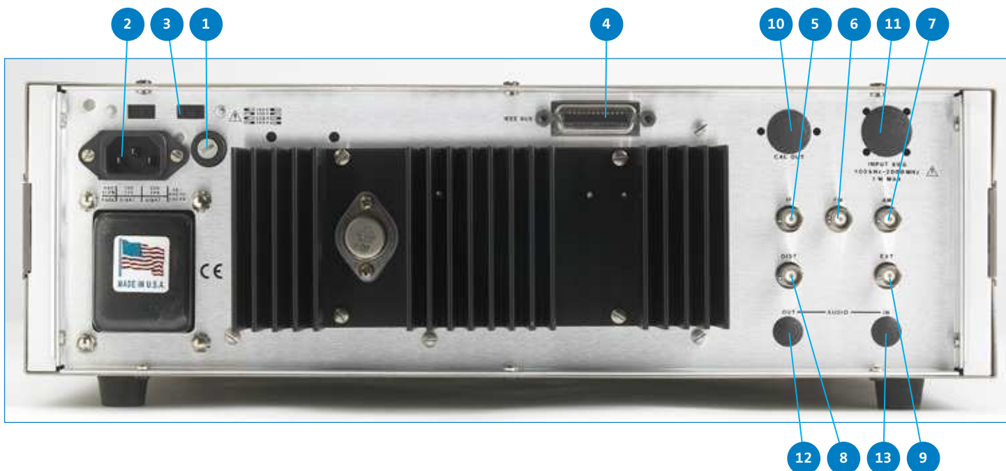
Figure-3: Rear View of 8201 Modulation Analyzer