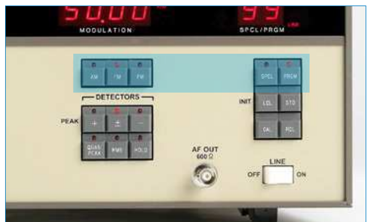
Figure-4: Function Keys of 8201 Modulation Analyzer