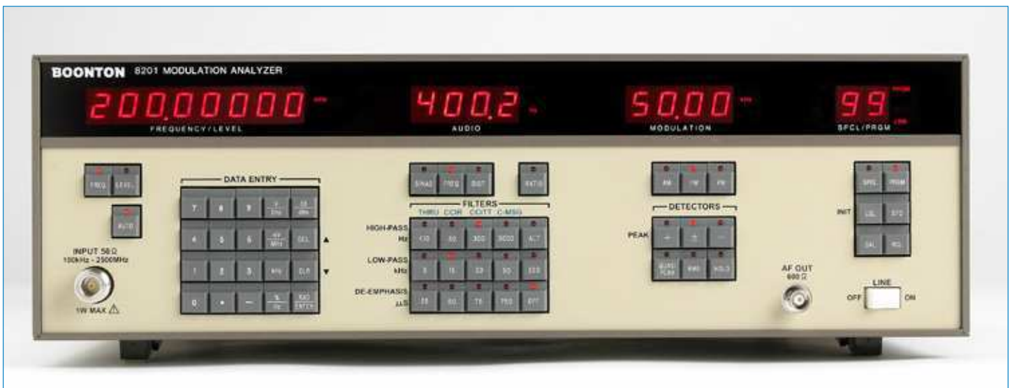
Figure-1: 8201 Modulation Analyzer Displays