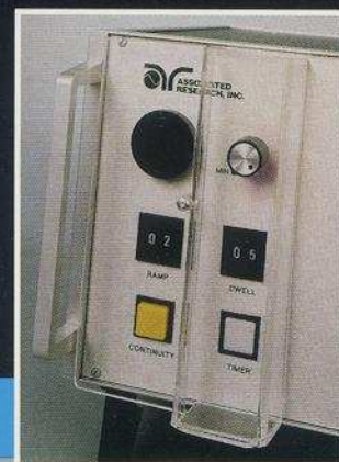
Shield Option locks Ramp & Dwell timer settings, Continuity and Timer test procedures. Cat. No HPP-01