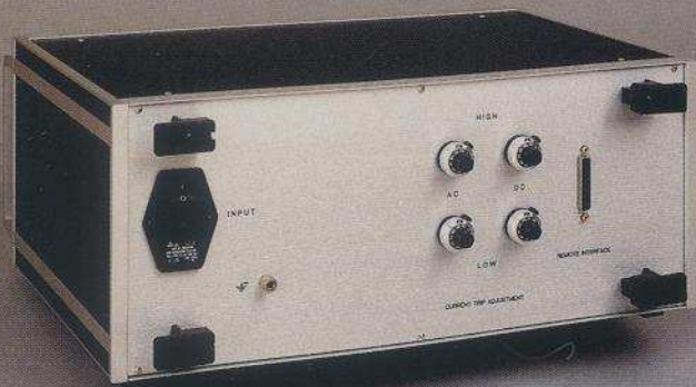
Backside view showing the 10-Turn Leakage Current Adjustment controls, Input Power, Remote Interface and Safety Ground connector.