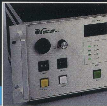
Shown above is our 19 inch rack mount kit option to convert the standard bench top cabinet to rack mount. Catalog Number HPP-02.

The clear plastic shield allows full view of but restricts the operator from varying settings of Output Voltage, Ramp time or Dwell time. Guards against disabling the Continuity Check feature.