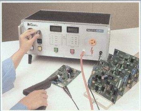
Shown: Component testing using the ARI Model SP02 Safe-T Probe®.