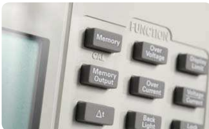
Figure 1. Output sequencing made easy with intuitive keypads

Both models of the U8030 series come with a set of features to suit your needs while remaining easy to use. The LCD screen displays both voltage and current readings in a one-view panel while the all ON/OFF button allows multiple outputs to be controlled simultaneously. Additionally, the auto-track feature simplifies setup between output 1 and output 2. With these, you get a solid bench power supply plus a set of convenient and easy to use features.