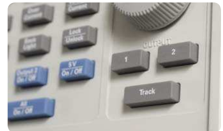
Figure 3. Simplifies Output 1 and Output 2 setup with tracking feature