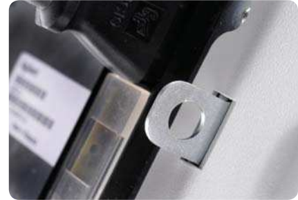
Physical lock mechanism as illustrated

Essential security features: Over-voltage protection (OVP)/ Over-current protection (OCP), keypad lock and physical lock mechanism