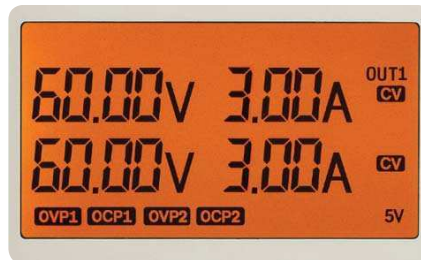
Figure 2. Backlight on/off feature with dual reading (voltage and current) on an LCD display