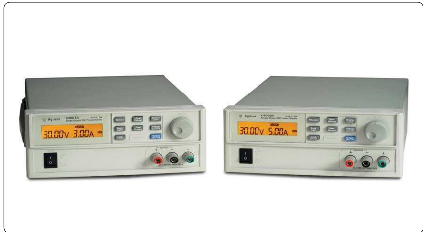
Figure 1. The U8001A 90 W and U8002A 150 W single output DC power supplies