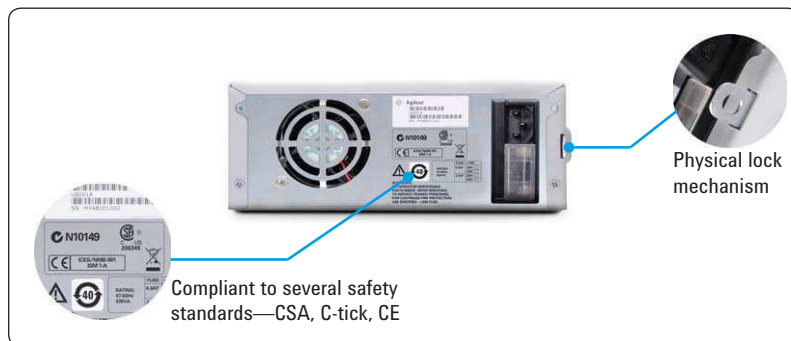
Figure 3. Safety and security features of the U8000 Series single output DC power supplies