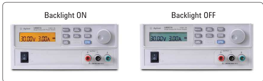
Figure 2. Backlight on/off options for LCD display