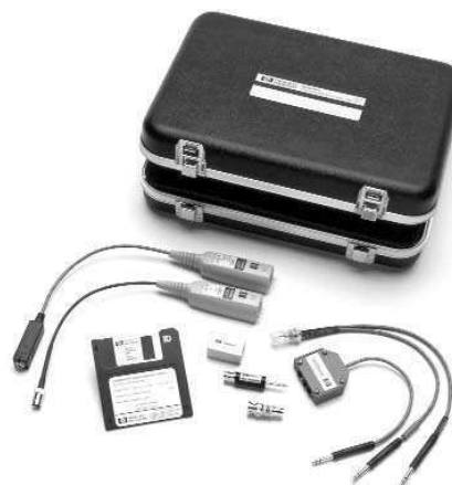
E2625A Communications Mask Test Kit provides a 1.44MB floppy with the mask templates as well as a number of hardware connectors and adapters.

Use the mouse or Infiniium's keyboard to add labels or notes to your screen images, then save them to the floppy or hard disk. The built-in LAN interface makes it easy to transfer these images to network computers so you can share or document your work. You can also print the waveform to local or network printers.