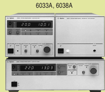
6030A, 6031A, 6032A, 6035A

Save rack space by using fewer outputs Reduce cost by using fewer power supplies