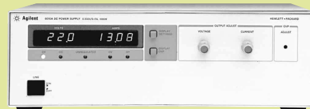
6010A, 6011A, 6012B, 6015A