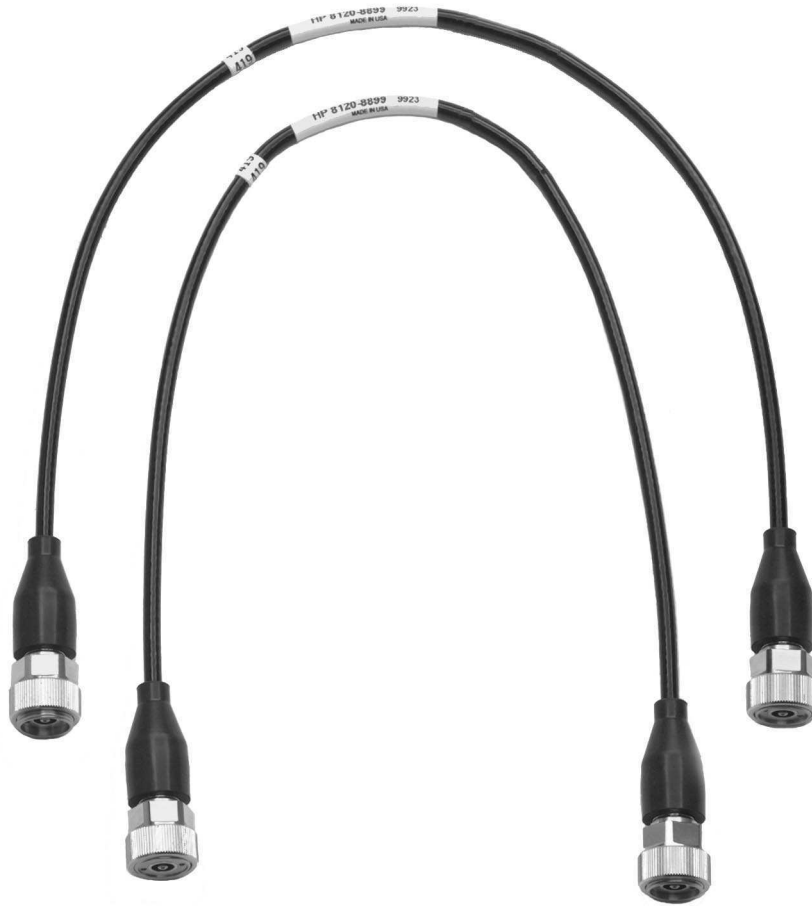
Figure 1. Model 11857D Cables, Option B24